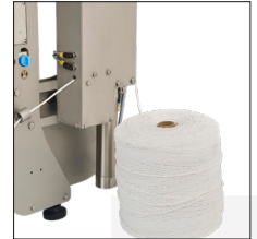
String feeder to produce ring sausages.