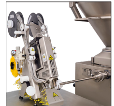
It can work connected to a vacuum or piston filler machine.