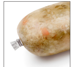
End of the sausage completely clean.