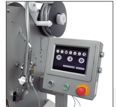
Accessory: Clip on spool for higher productions.