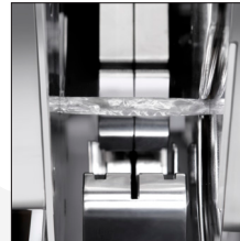
Clipper with voiding separators that cleans the end of the product.