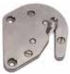
Knife with stainless support